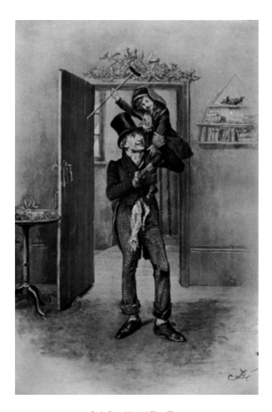
Bob Cratchit and Tiny Tim.