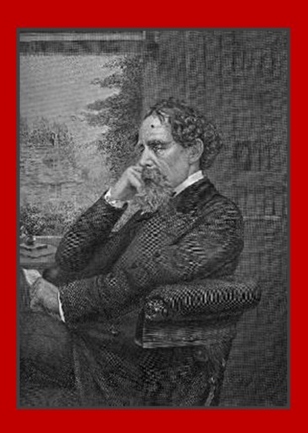
Charles Dickens 1844